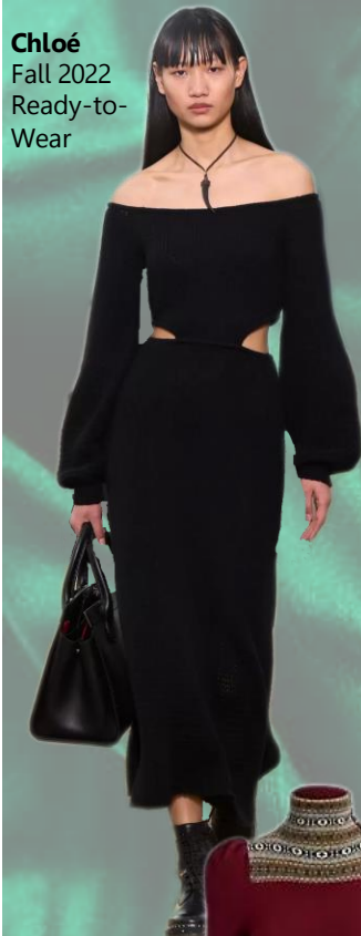
Chloé Fall 2022 Ready-to- Wear