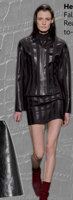
Hermès Fall 2022 Ready- to- Wear