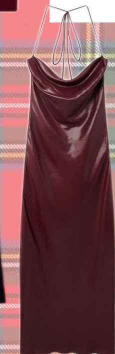
Stella McCartney Vegan Alter Mat Cowl Neck Slip Dress $1,250