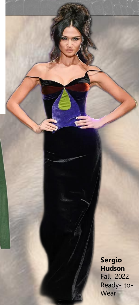
Sergio Hudson Fall 2022 Ready- to- Wear