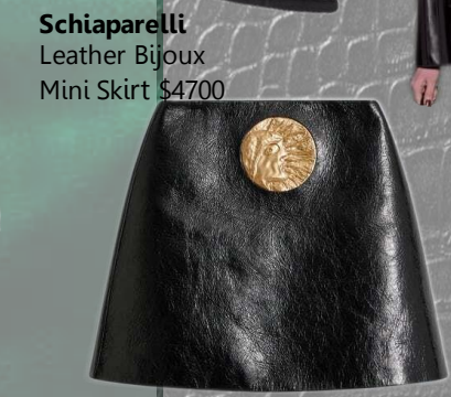
Schiaparelli Leather Bijoux Mini Skirt $4700