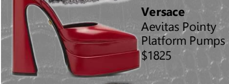
Versace Aevitas Pointy Platform Pumps $1825

90s is back! Stroll into the chilly fall weather with your favorite furs and fall tones. A 90s woman is always chic. Combine elegance and sensuality to achieve the perfect balance of grit and class.