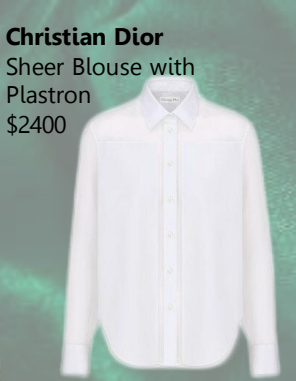
Christian Dior Sheer Blouse with Plastron $2400