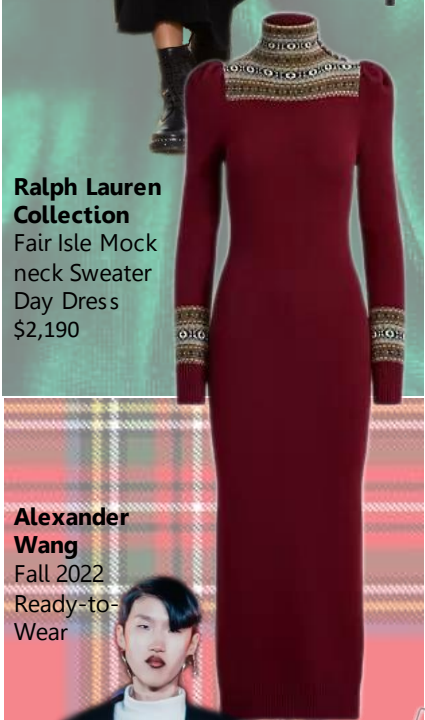
Ralph Lauren Collection Fair Isle Mock neck Sweater Day Dress $2,190