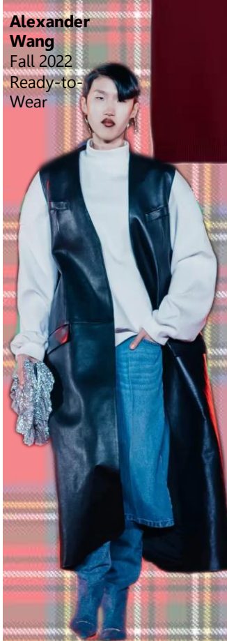
Alexander Wang Fall 2022 Ready-to- Wear