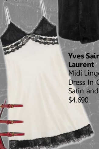
Yves Saint Laurent Midi Lingerie Dress In Crepe Satin and Lace $4,690