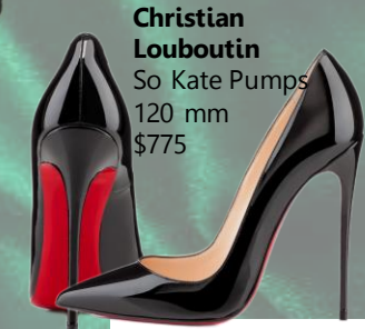
Christian Louboutin So Kate Pumps 120 mm $775