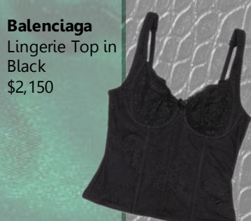
Balenciaga Lingerie Top in Black $2,150